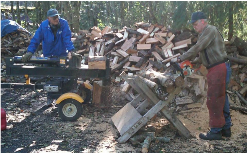
Carl Schuler 3/13 and Jerry Whittig 3/11